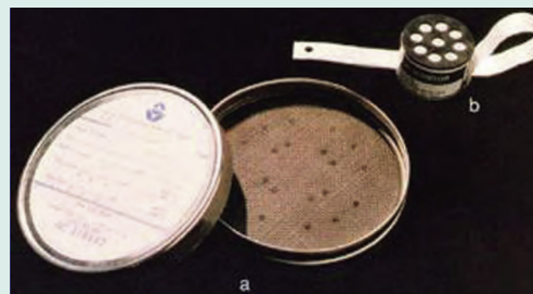
Radon test kit materials. Source: Health Housing Reference Manual, HHS and HUD. 2006. Available at: https://www.cdc.gov/nceh/publications/books/housing/housing_ref_manual_2012.pdf