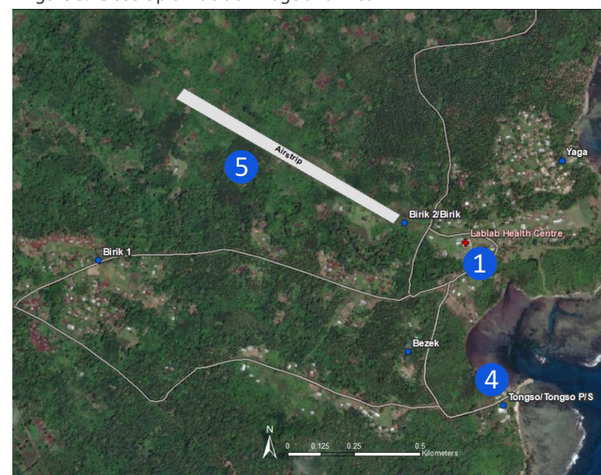
Figure 3. Close Up of Lablab Village and Area