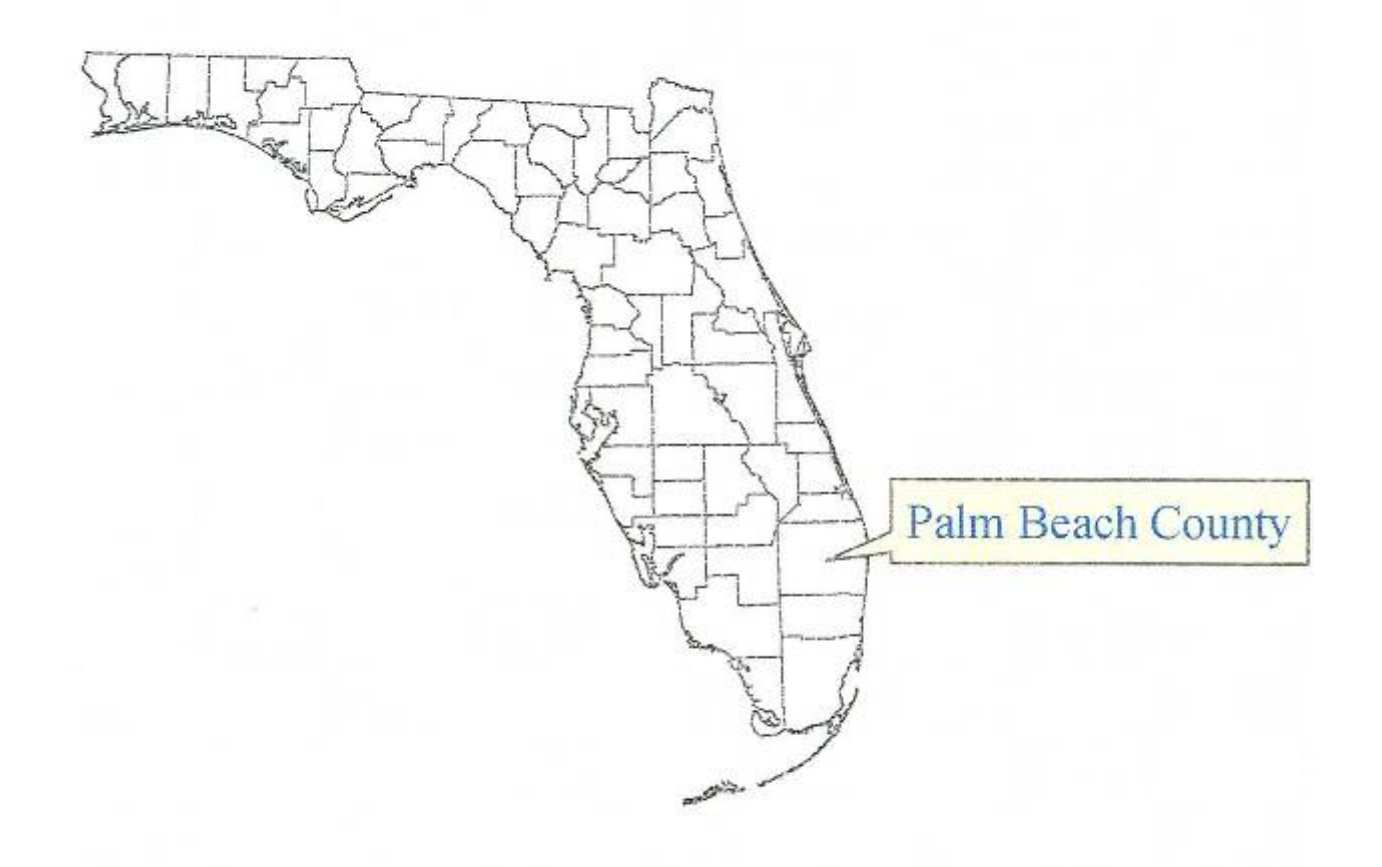
Figure 1 Mobile Medical Industries (MMI) County Location Map