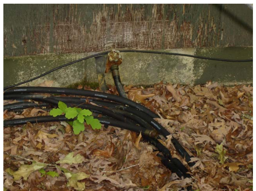
Water faucet located at the back of the house where ADH Engineering personnel collected the on-site water sample.