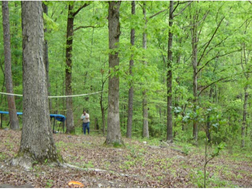
Arkansas Department of Environmental Quality personnel collecting a surface soil sample on-site near the house.

Figure 3. Photographs from the Arkansas Department of Health (ADH) site visit to 7125 Anderson Road, Alexander, property on April 17, 2007.