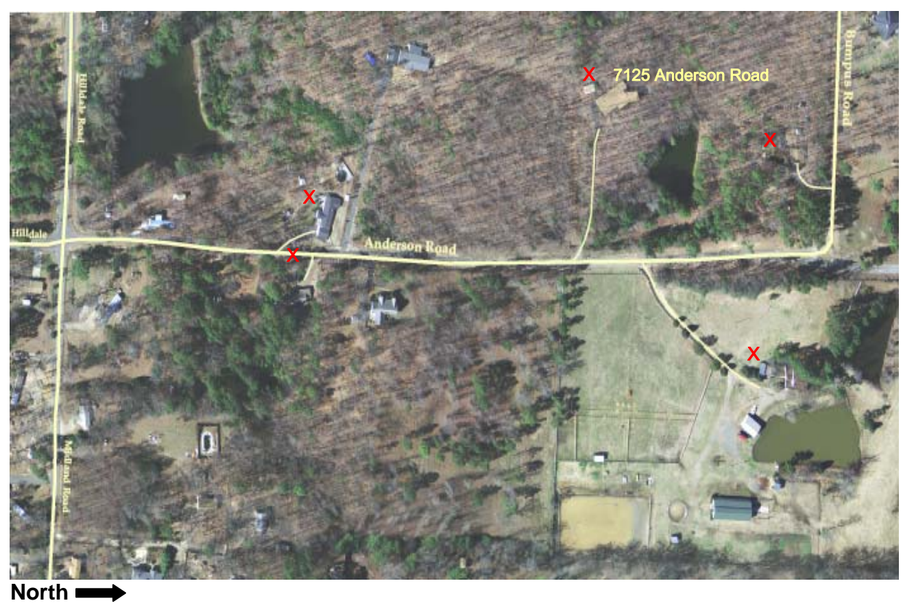
Figure 2. Location of five private well water samples collected by the Arkansas Department of Health on April 24, 2007 at 7125 Anderson Road Property and surrounding residences on Anderson Road and Bumpus Road [8].