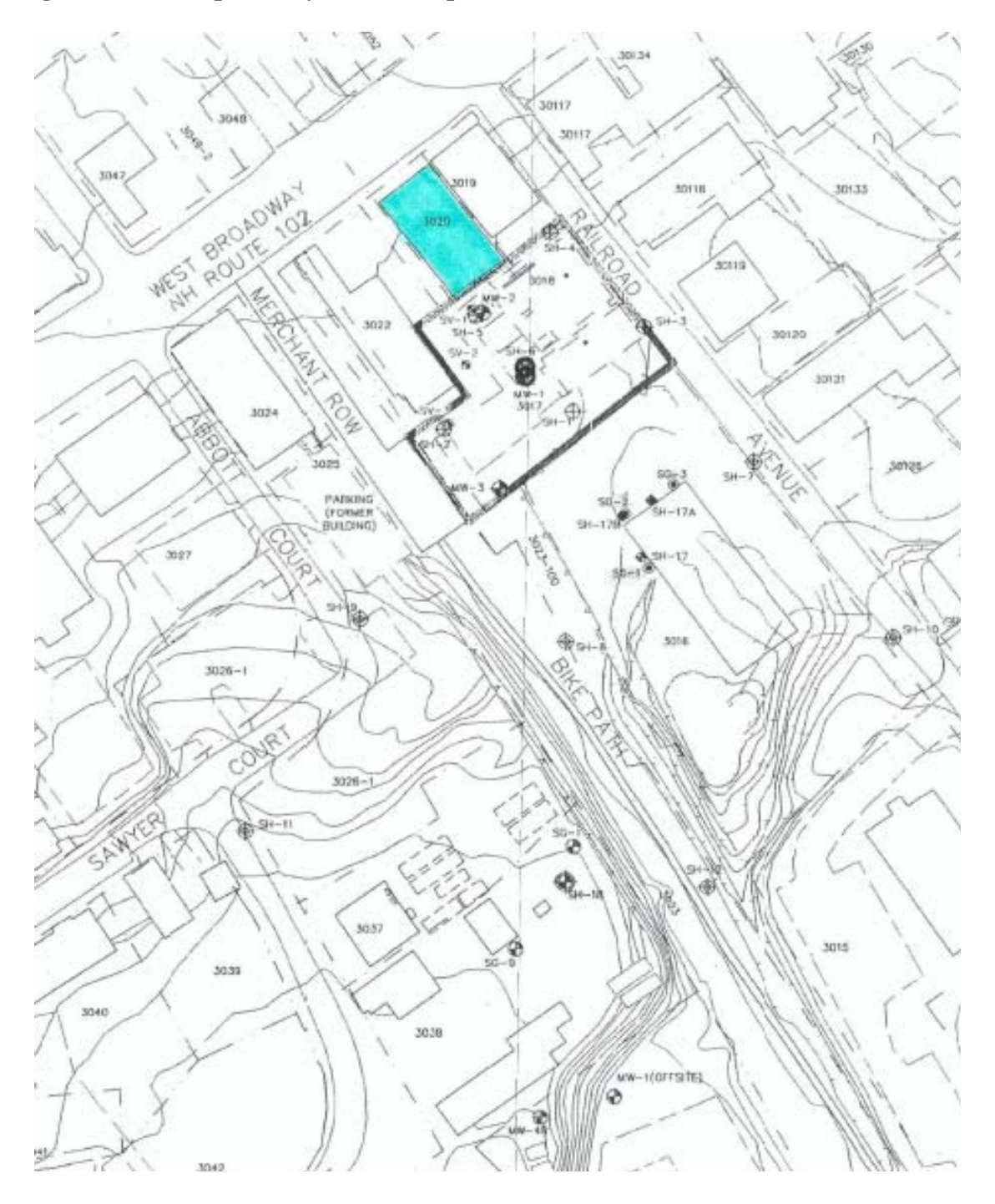
Figure 1. Site Map - Derry, New Hampshire (2).