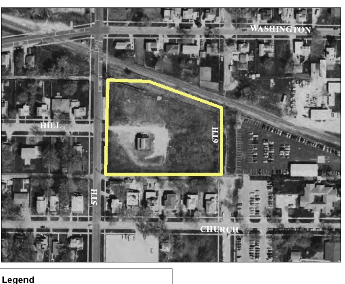
Figure 1. Champaign Manufactured Gas Plant Area Site Location Map