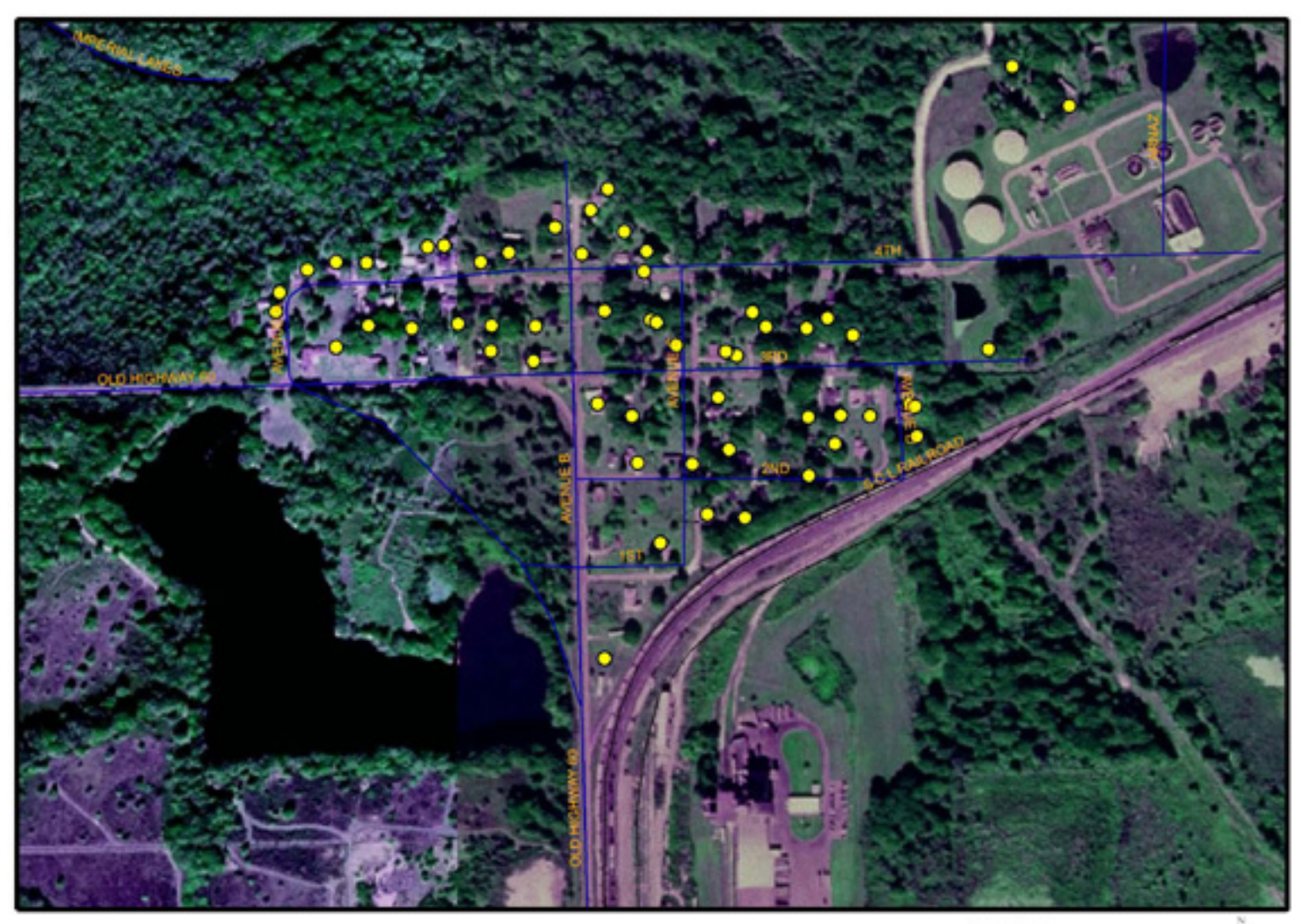
Figure 3: Fuller Heights Community