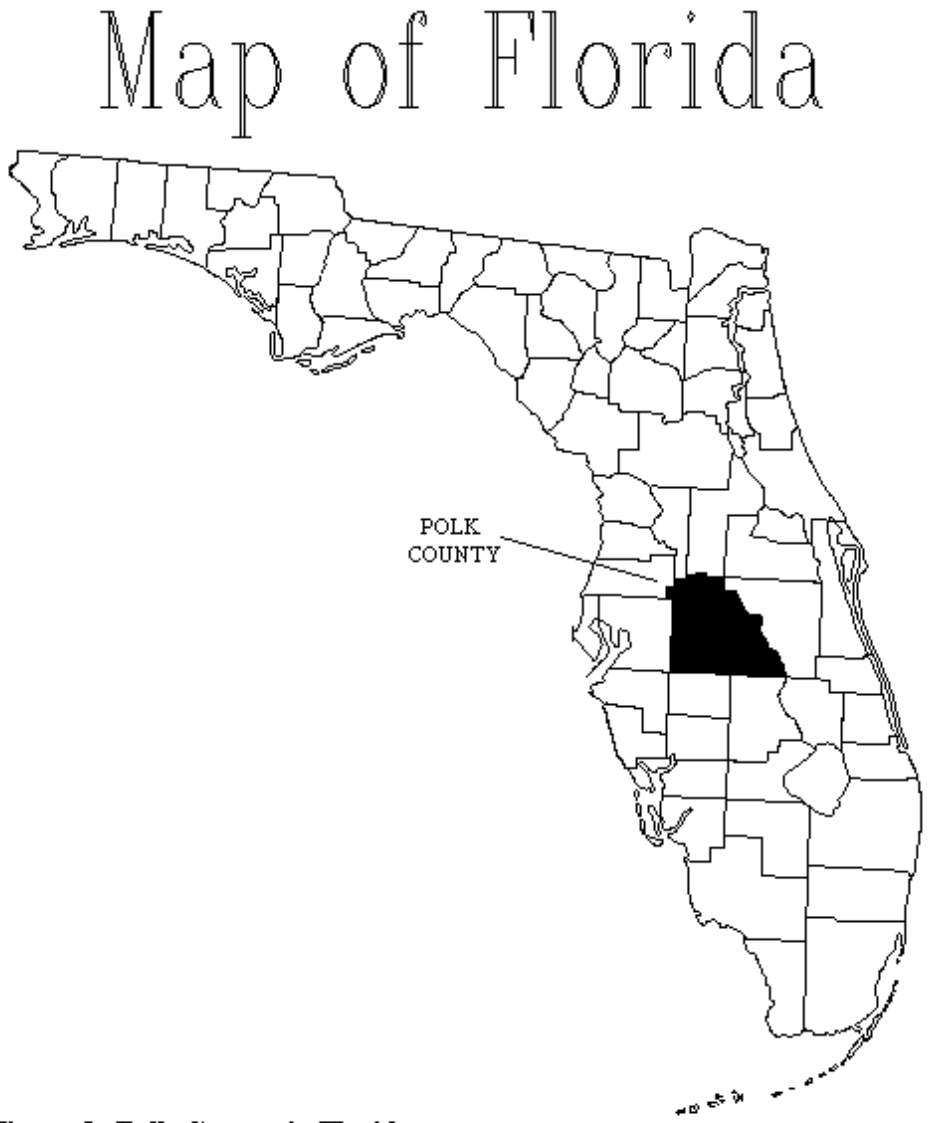
Figure 1: Polk County in Florida