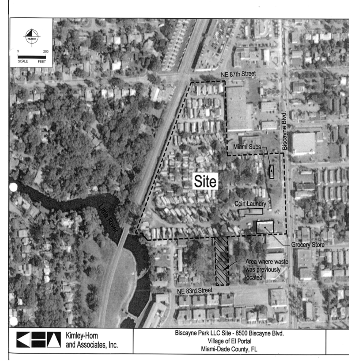
Figure 2. 2005 Aerial Photograph of the Little Farm Mobile Home Park