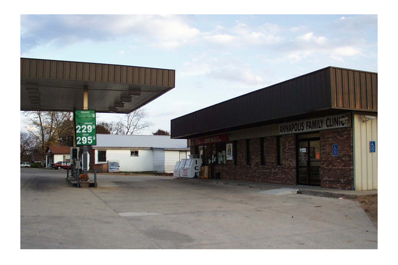
Figure 1. Photo of Sherrill Mini-Mart and Annapolis Family Clinic, Annapolis, MO