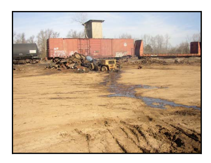
Figure 3. Motor oil spill