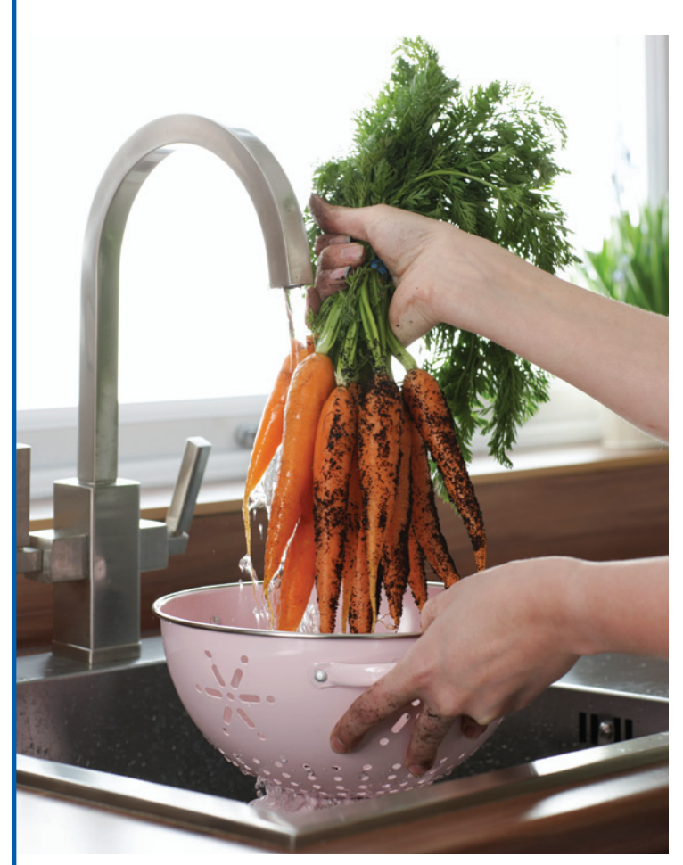
Wash fruits and vegetables