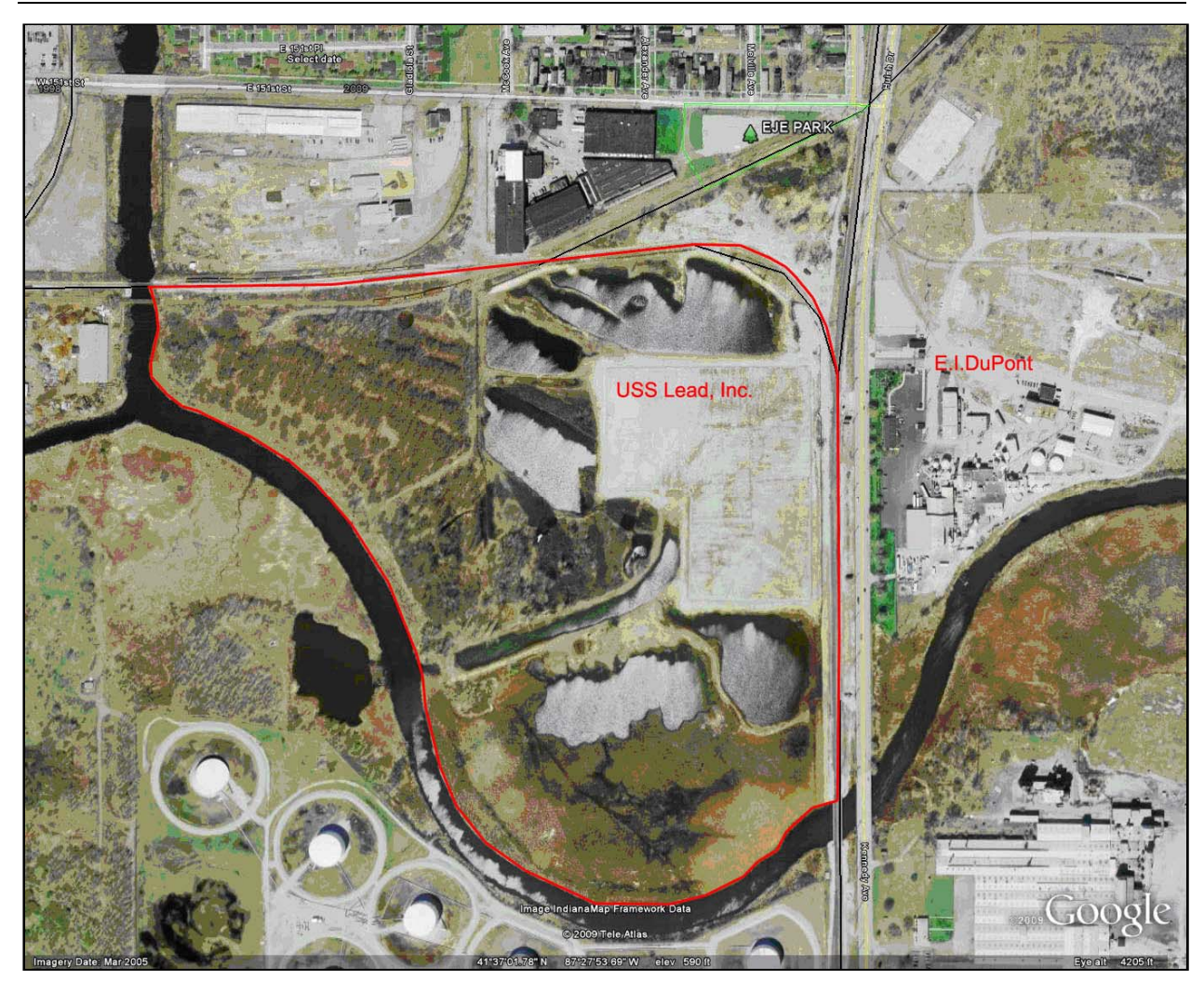
Figure 1 Aerial View of Former USS Lead Site*