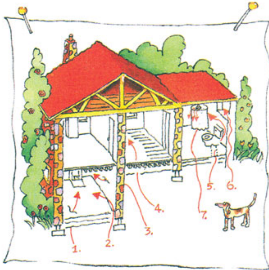
Figure 1. Sources of Radon and Common Entry Points

Radon is also released from materials inside the homes, such as