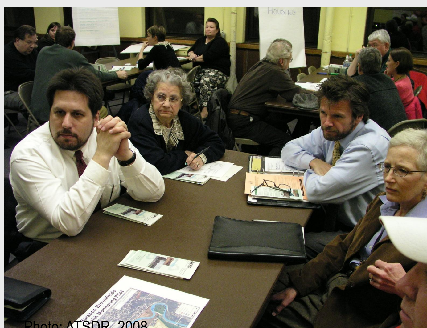
ATSDR 2008: Development Community Meeting

Using the Action Model, the Development Community established 33 public health measurement indicators of baseline community health status, such as an inventory of brownfields and incompatibly located sites; pollution of the Baraboo River (sanitary sewers, stormwater, water quality); extent and condition of sidewalks; linkages to the downtown shopping area; recreational use of trails; river access; and many others. Under the stewardship of the City Administrator, these indicators will be tracked over time to assess impacts of redevelopment on community health.