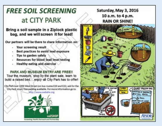
Figure 2: Example Outreach Flyer to attach with Twitter post available in soilSHOP Toolkit.

Calling all gardeners! Collect a soil sample from your garden and have it screened for FREE at City Park on May 3rd! #soilSHOP.