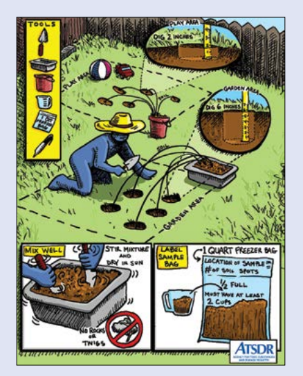
Figure 1: Example Sample Collection Cartoon to attach with Facebook post available in soilSHOP Toolkit.