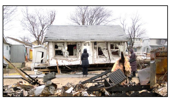
Hurricane Sandy -Breezy Point, NY

Social vulnerability refers to the demographic and socioeconomic factors that contribute to communities being more adversely affected by public health emergencies and other external hazards and stressors that cause disease and injury. Factors such as poverty, lack of access to transportation, and crowded housing may weaken a community's ability to respond and adapt to public health emergencies.