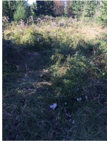
Inside front gate