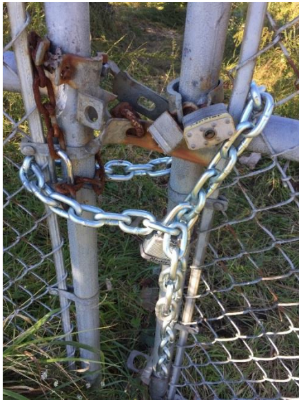
Chain on front gate