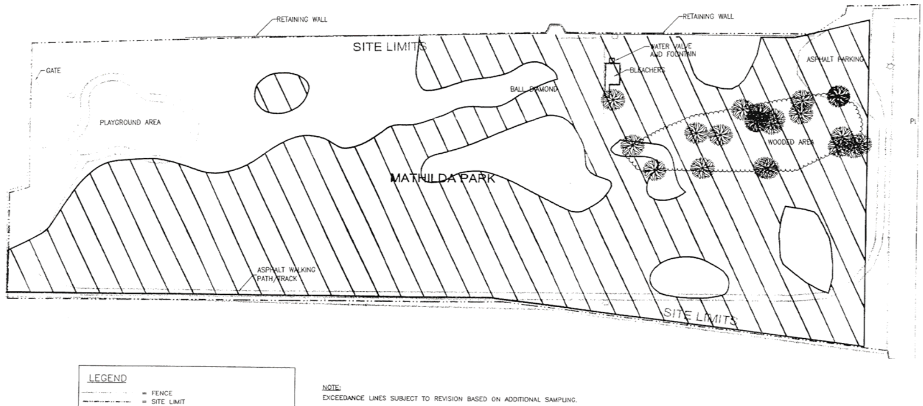
Figure 3: Matilda Park