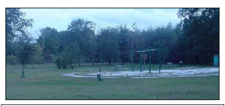
5. Matilda Park (MP) before remediation began. Children and adults may have been exposed to contaminants in some areas with bare soil.