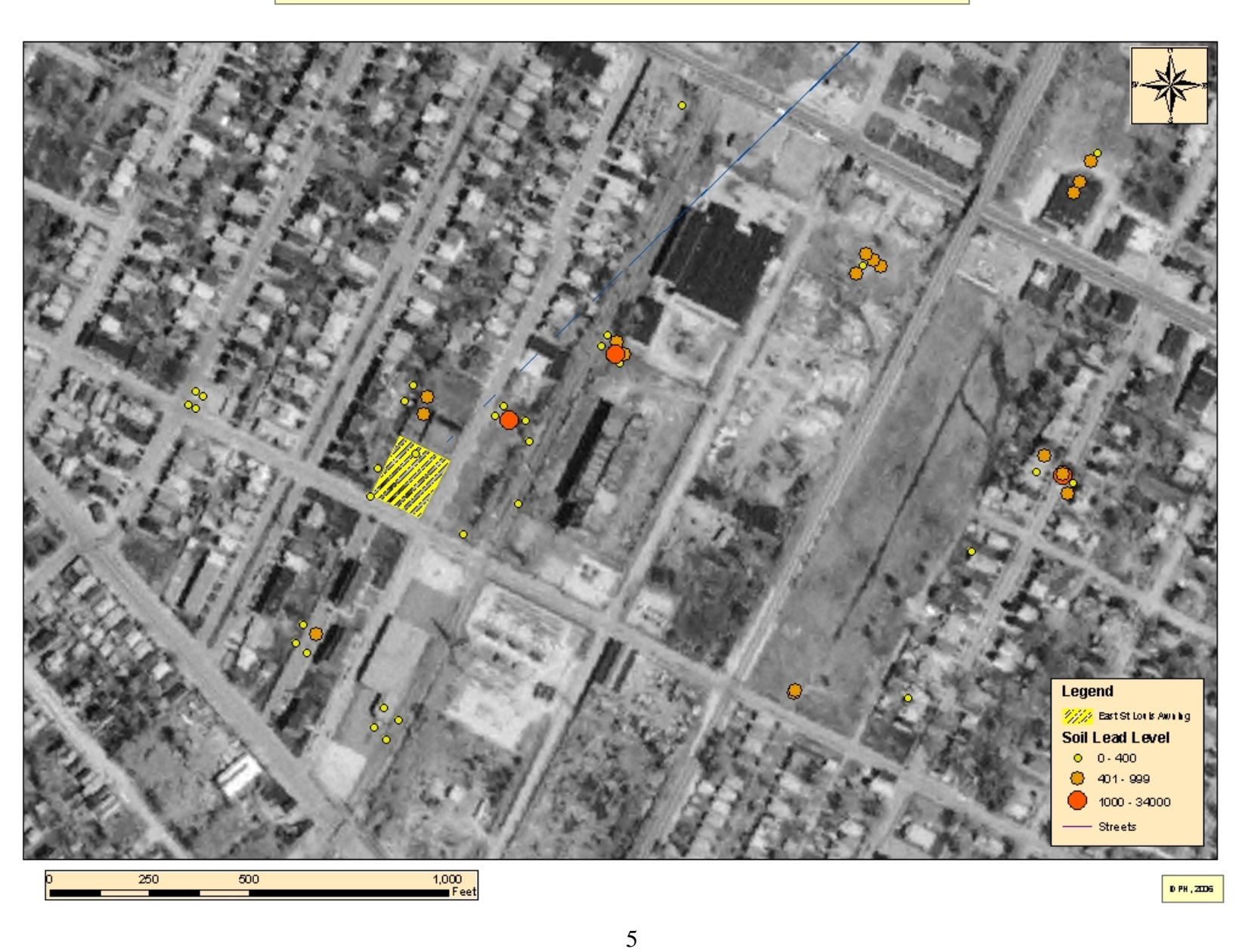
Figure 2 - East St. Louis Awning - Sample Location Map