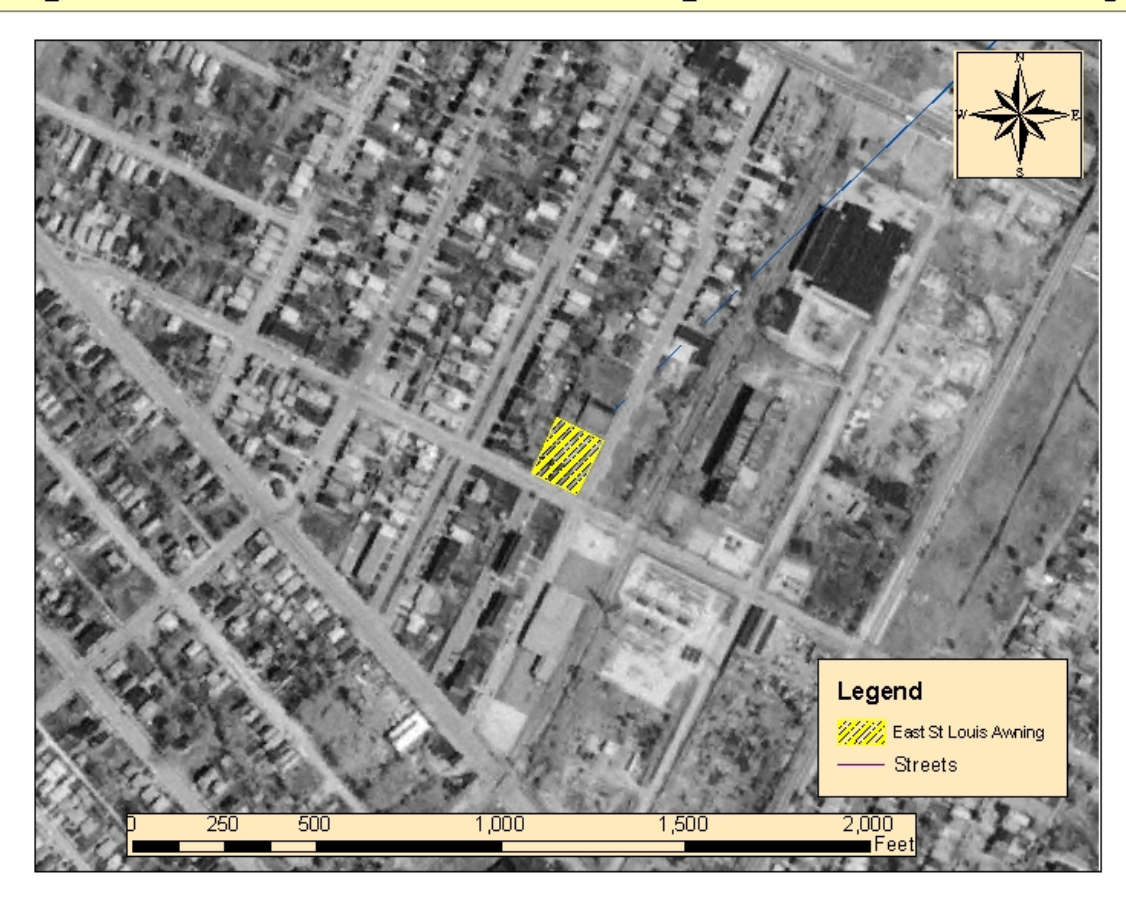
Figure 1 - East St. Louis Awning - Site Location Map