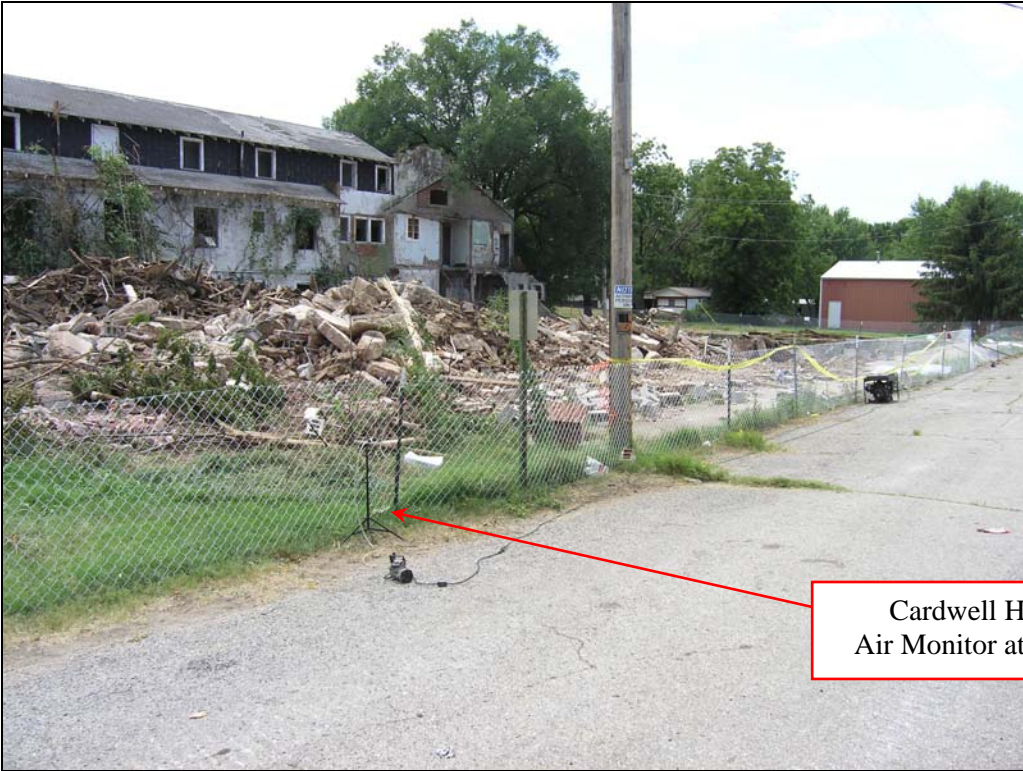
Cardwell Hospital Site, Air Monitor at Site Perimeter