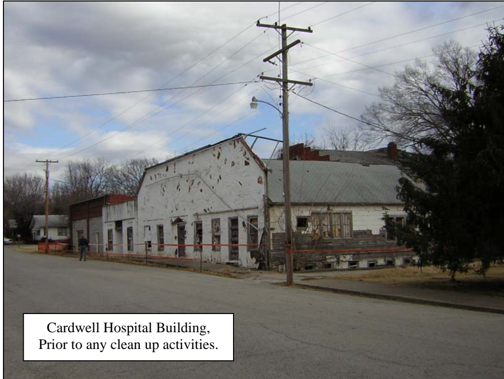
Figure 2 Cardwell Hospital Building Before and During Demolition Cardwell Hospital Site Stella, Missouri