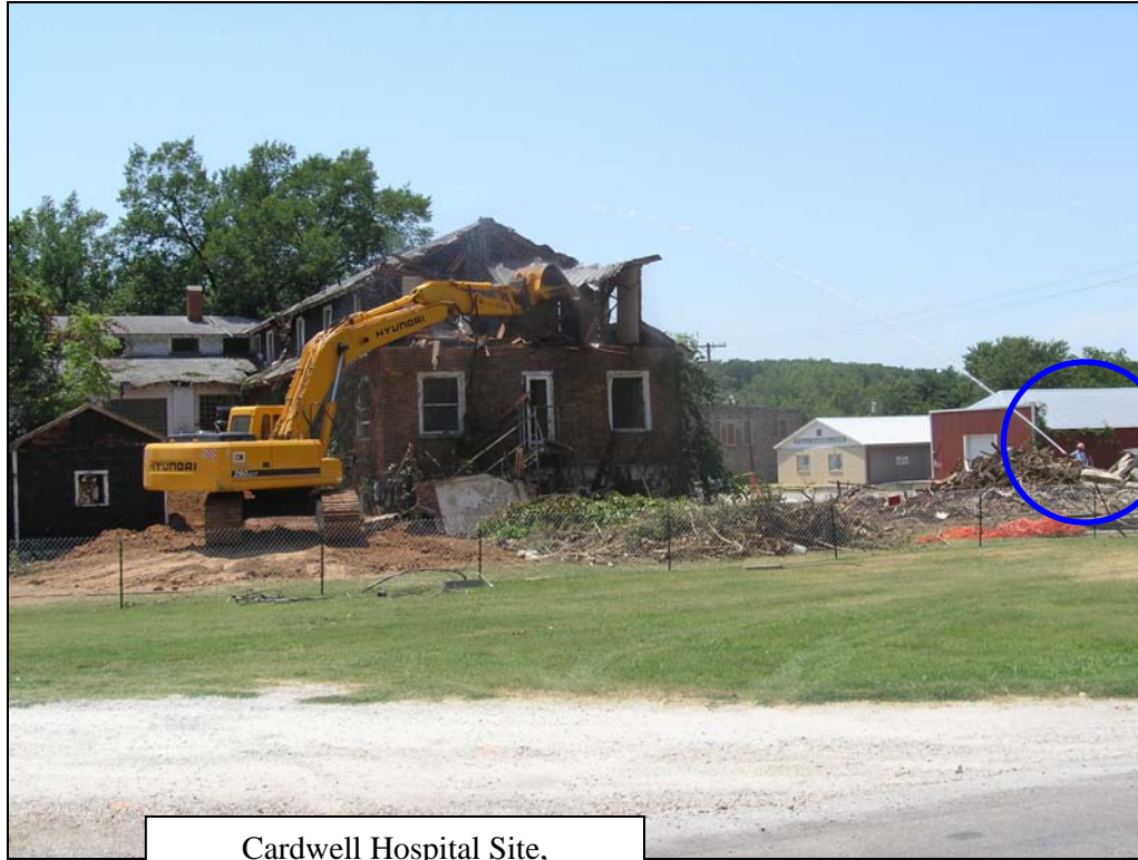
Cardwell Hospital Site, Dust suppression application. (circled in blue)