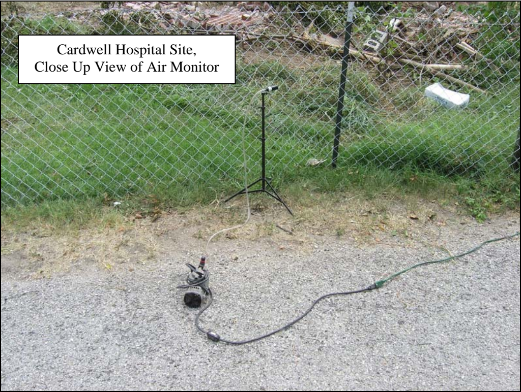
Cardwell Hospital Site, Close Up View of Air Monitor