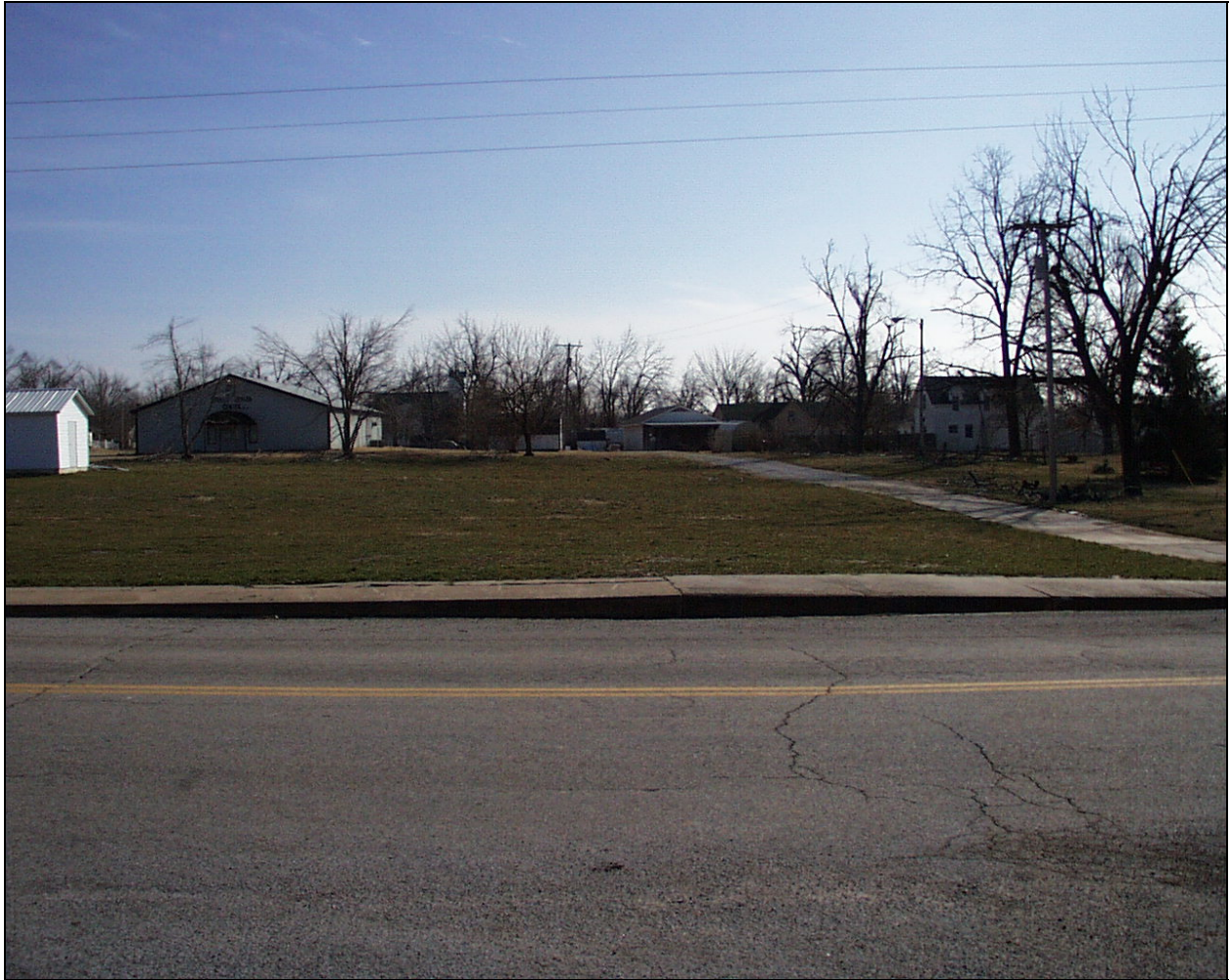
Figure 5 Cardwell Hospital Site, Restoration Complete Cardwell Hospital Site Stella, Missouri