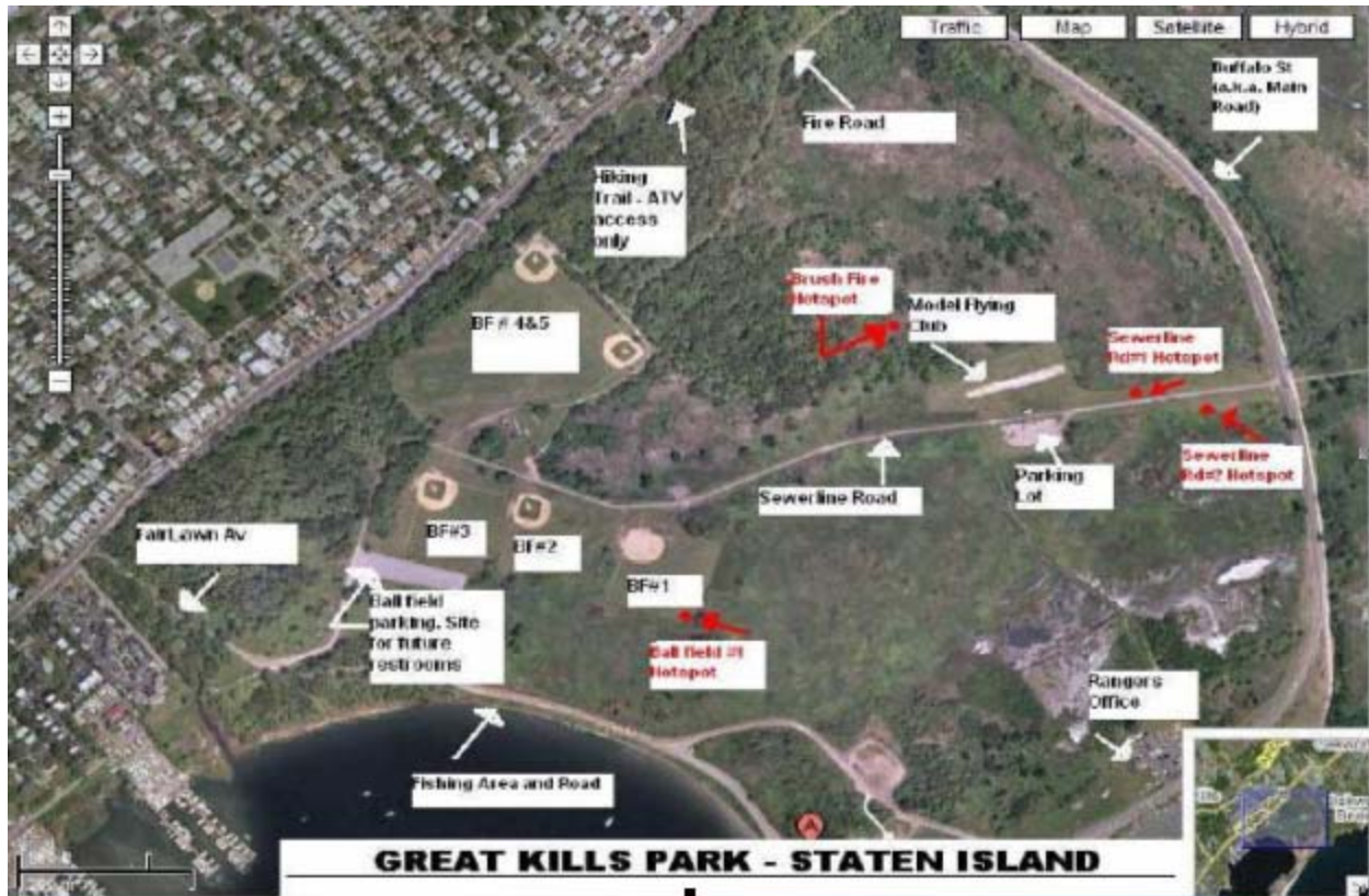
Figure 1. Great Kills Park and survey areas

The park is open during daylight hours daily. The official sport season is from the third week in April through November for baseball, softball, and soccer. These activities are at the athletic field complex. The sport activities are usually over by August for baseball and softball; soccer typically ends in November.