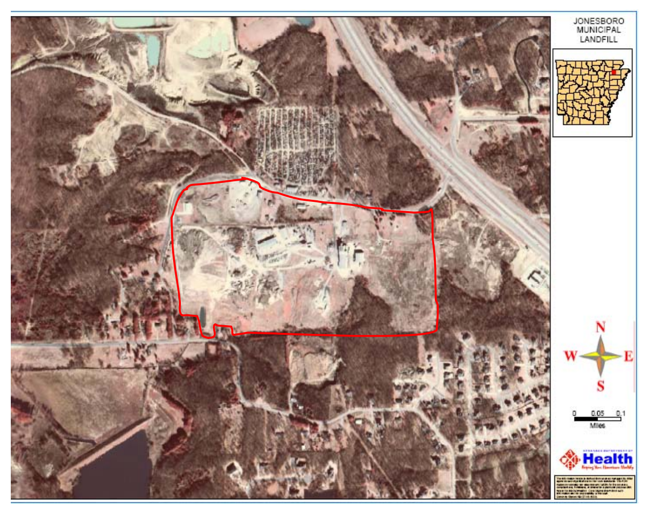
Figure 1. Jonesboro Municipal Landfill Aerial Photo