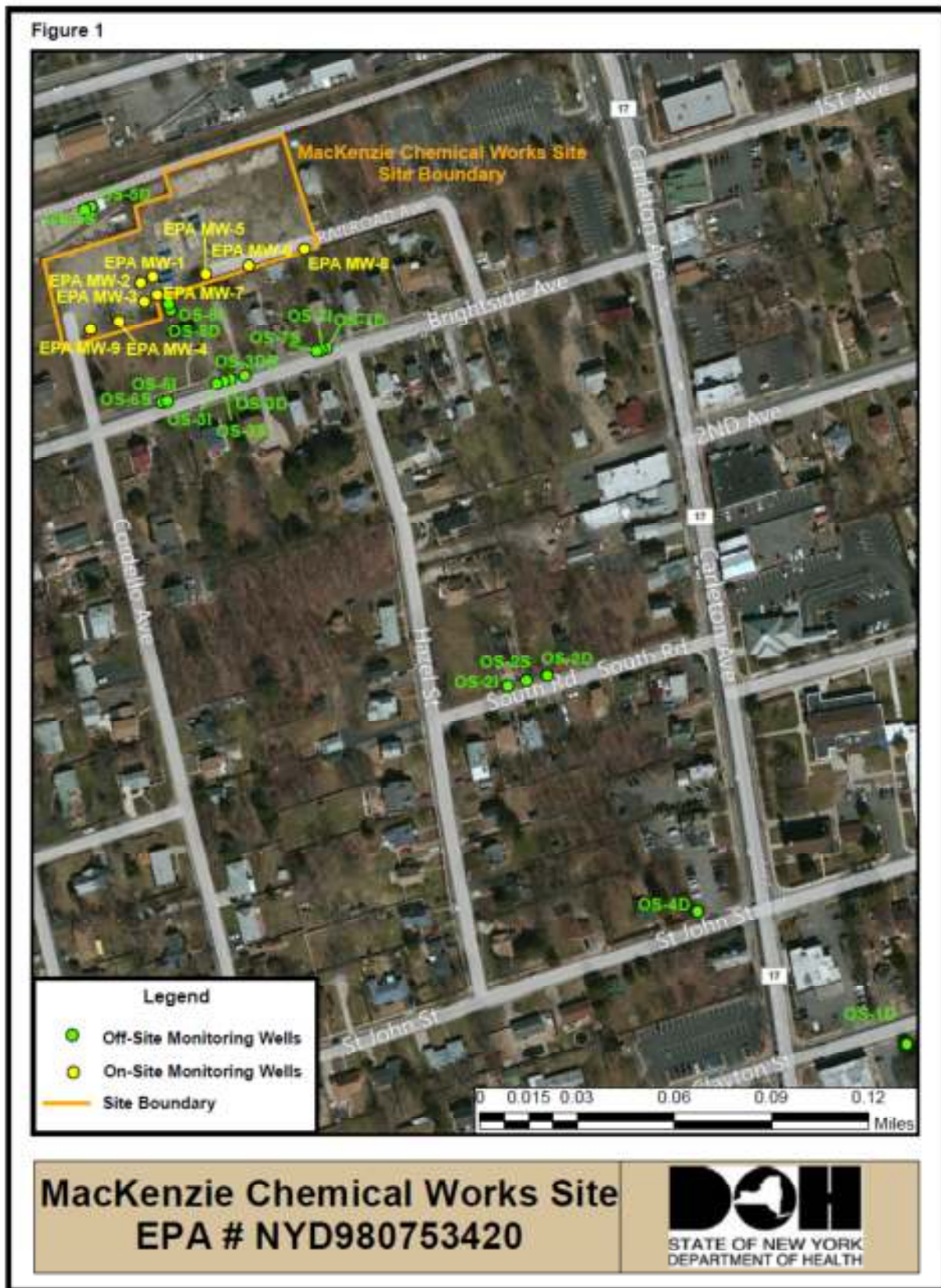
Figure 1. Location of MacKenzie Chemical Works site and selected monitoring wells.