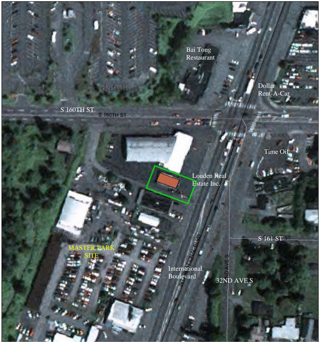
Figure 1 – Vicinity Map Master Park Site SeaTac, Washington