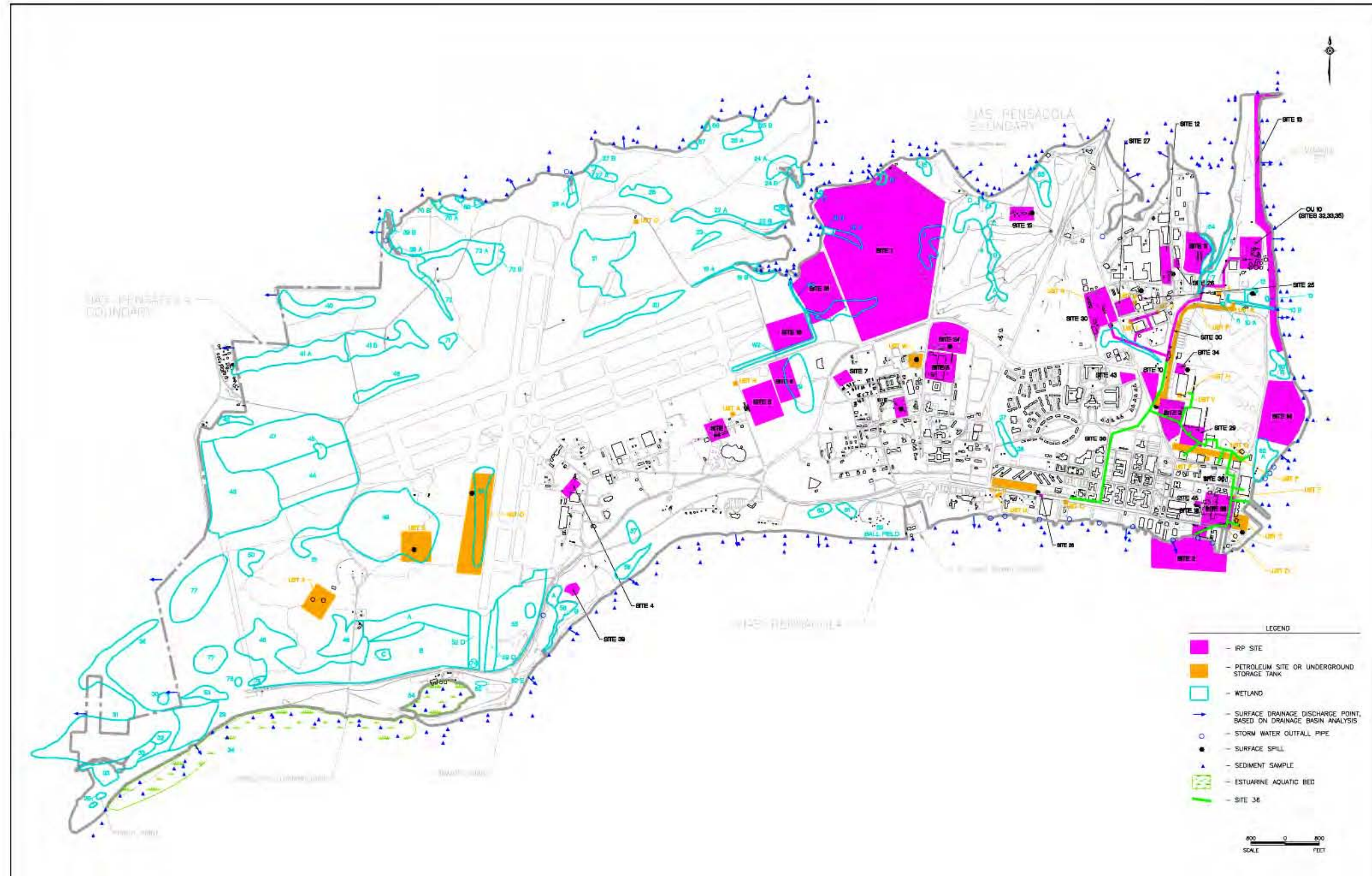
Figure 2. Installation Restoration Program Sites at Naval Air Station Pensacola