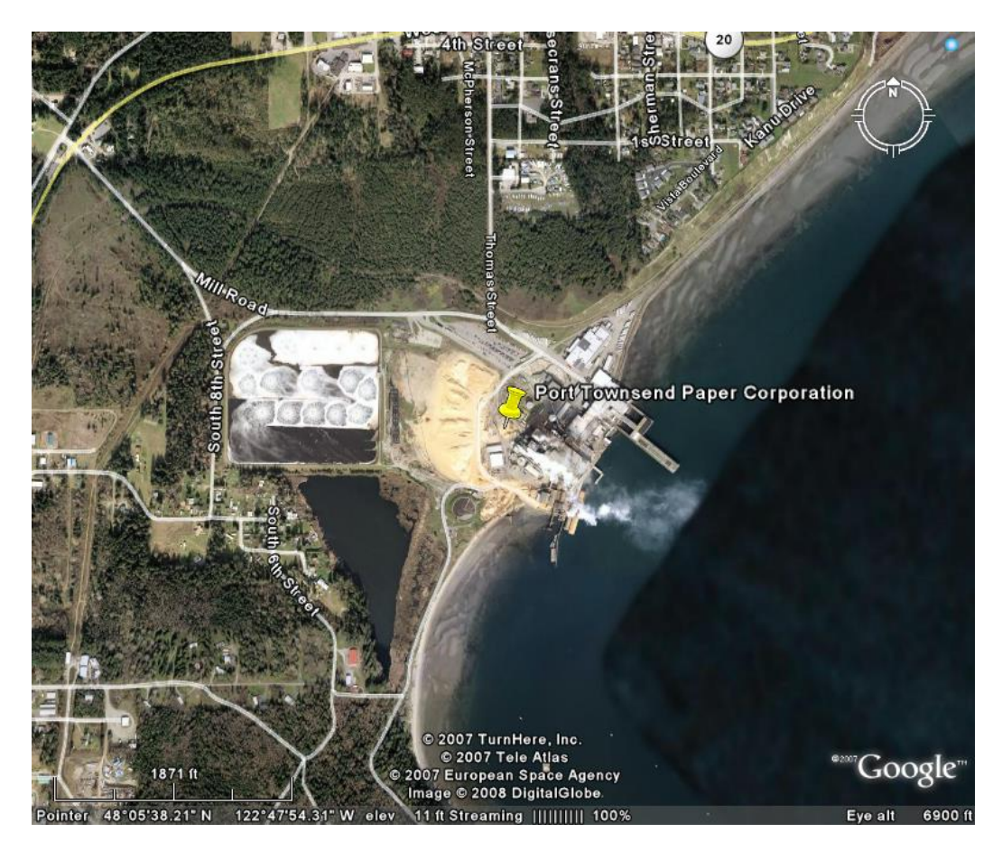
Figure 1. Port Townsend Paper Mill, Jefferson County, Washington