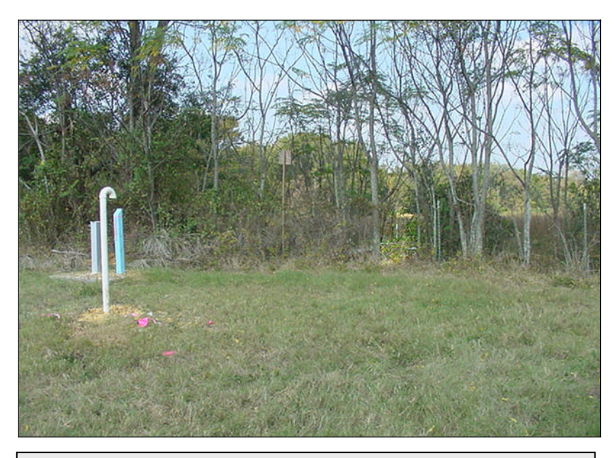
Figure 4: Site Photographs (Cont.)