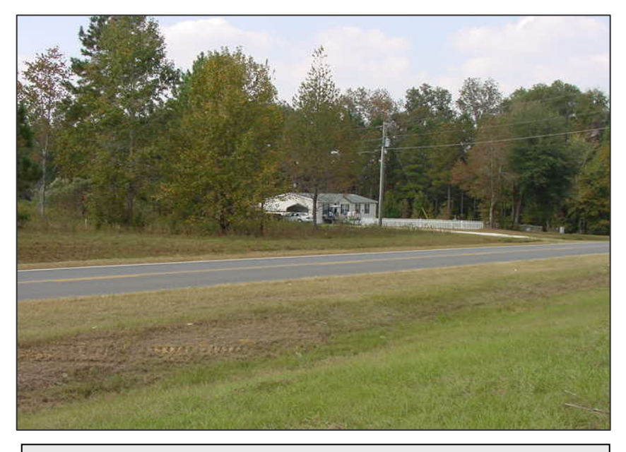
Figure 4: Site Photographs

From the western landfill boundary showing the proximity of a residence using an individual water well in the path of the groundwater contamination plume.