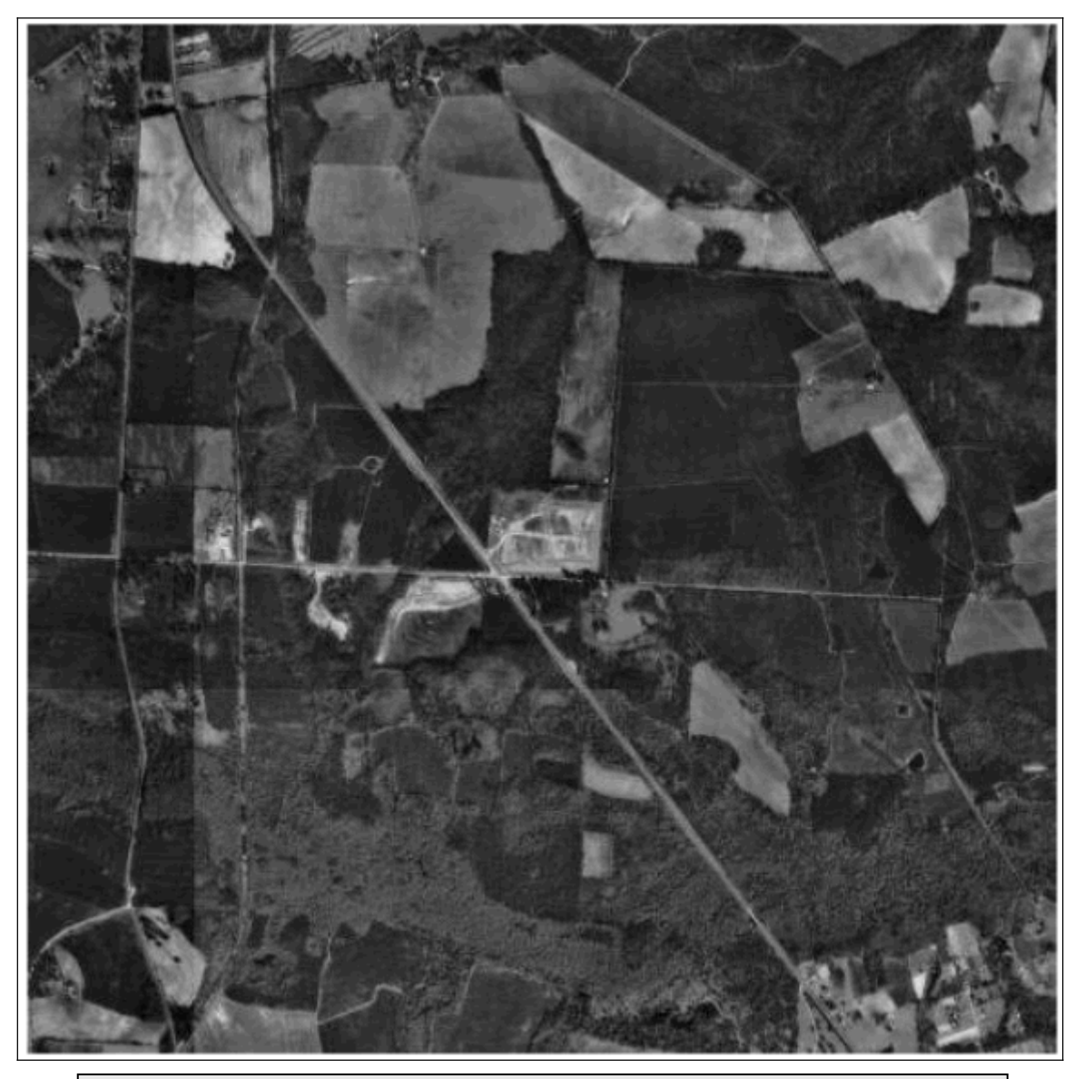
Figure 2: Aerial Photograph

Satellite photograph of the Quitman Landfill and surrounding area. The site is bordered to the north, south, and east by private residences and undeveloped land, and to the west by a subdivision.