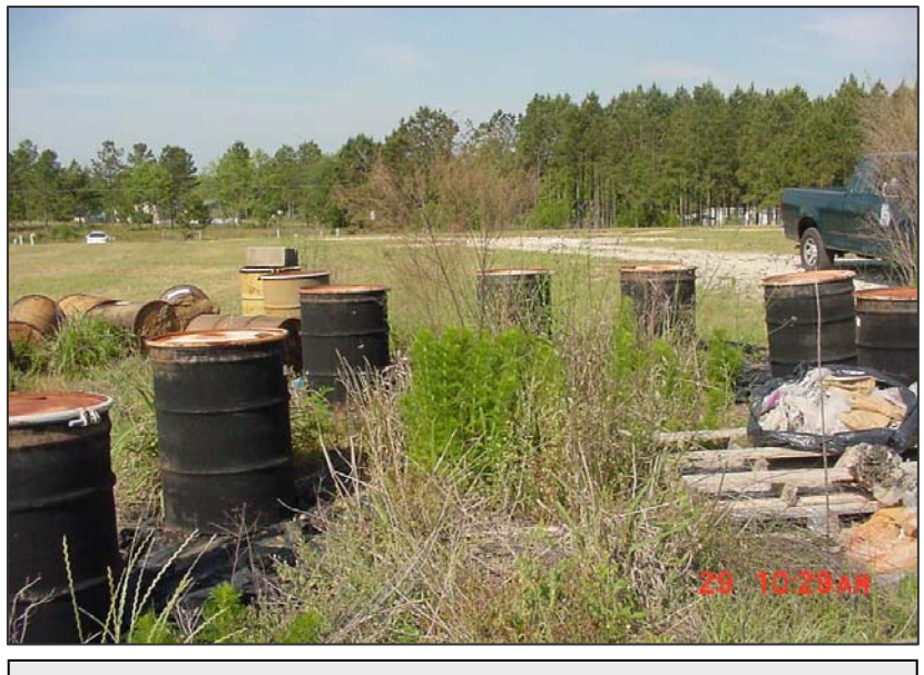
55-gallon drums removed from the Landfill by Brooks County. The contents of the drums are unknown.