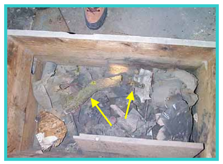
Figure 2 . Box Containing Two Pieces of Depleted Uranium Located at Red River Aluminum Site in Stamps, Arkansas.