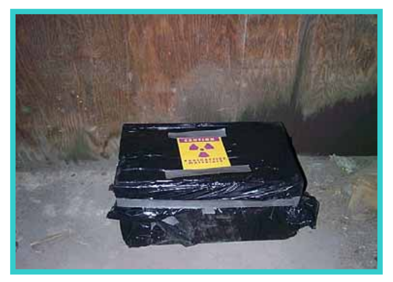
Figure 3 . Box Containing Depleted Uranium Properly Labeled for Pickup by Red River Army Depot.