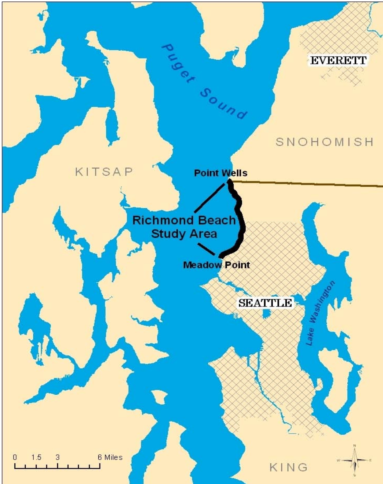
Figure 1. Geoduck site location and tracts of interest (Richmond Beach, King County, Washington).