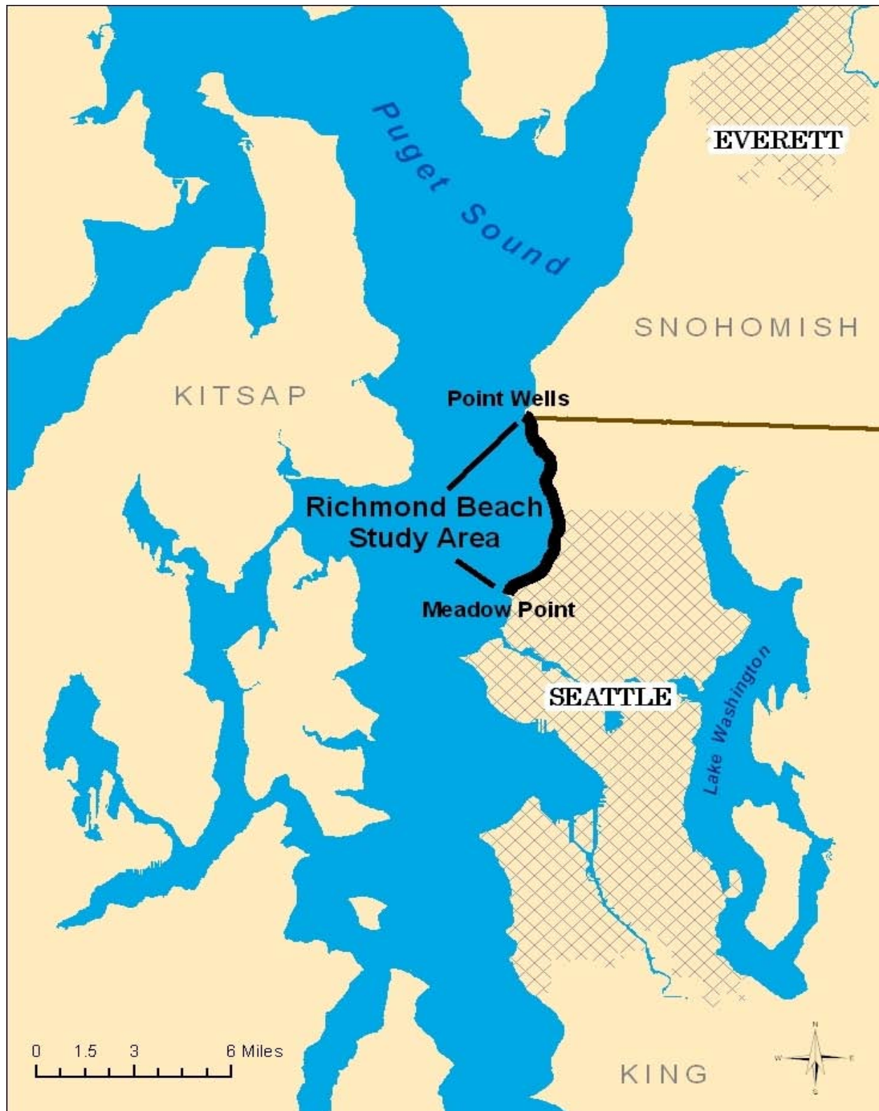
Figure 1. Geoduck site location and tracts of interest (Richmond Beach, King County, Washington).