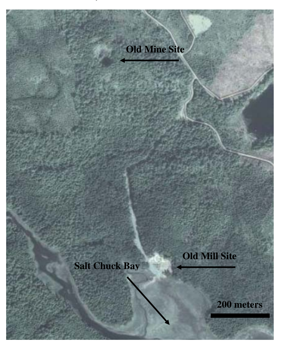
Figure 2. Satellite image of site location at north end of Salt Chuck Bay, Kasaan Peninsula, Prince of Wales Island, southeast Alaska.