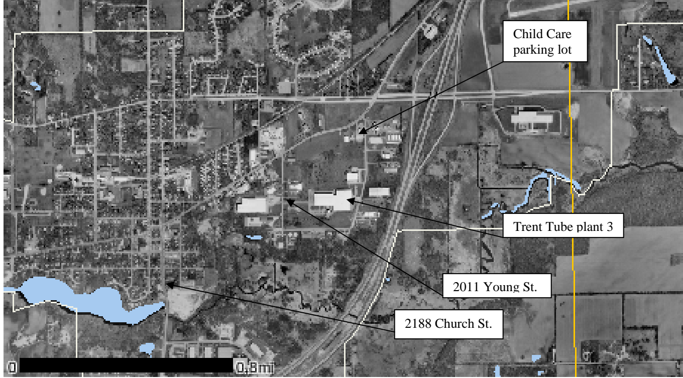
Map reference: Wisconsin Department of Natural Resources Webview (http://maps.dnr.state.wi.us/imf/dnrimf.jsp?site=webview)

Not listed in Table 1 are the composite predicted TCE concentrations presented in the map included in Appendix II. According to the predictions of the air dispersion model (WDNR 2005), maximum TCE concentrations near plant 3 (200-300 yards) could reach 31 parts per billion, air volume (ppbv), or 177\mu g/m^3 , with corresponding residential concentrations being 2.4 ppbv ( 13 \mu g/m^3 ).