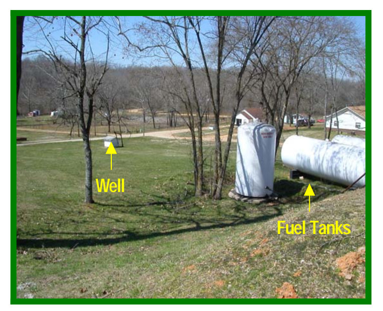
Figure 2. Fuel tanks and groundwater well that serve Warm Springs Christian Center