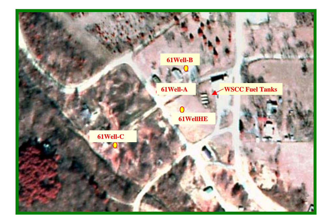
Figure 3. Aerial photo depicting wells sampled and Warm Springs Christian Center fuel tanks