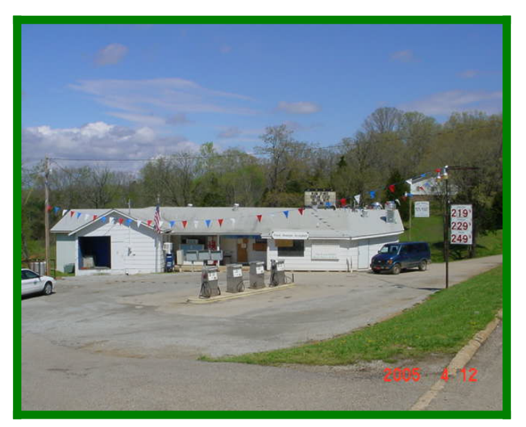
Figure 1. Warm Springs Christian Center