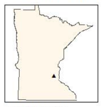
State of Minnesota