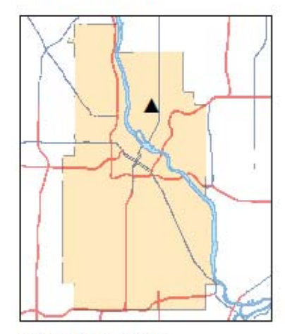
City of Minneapolis