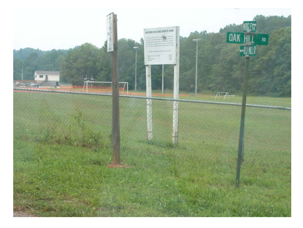
Figure 2. Buford McCord Sports Park.