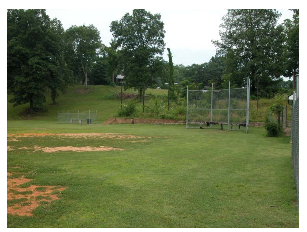
Figure 1. Athletic Field (a/k/a Old Ball Field).