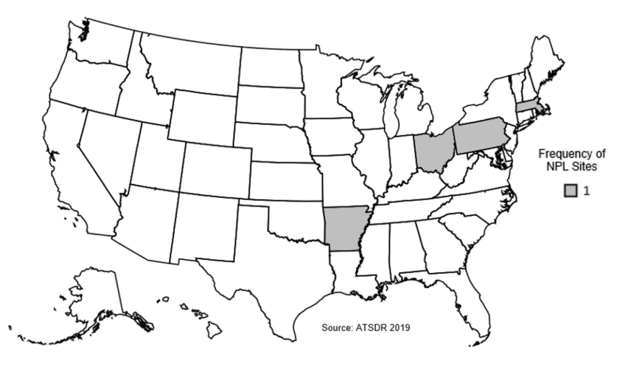
Figure 5-2. Number of NPL Sites with Chlordecone Contamination