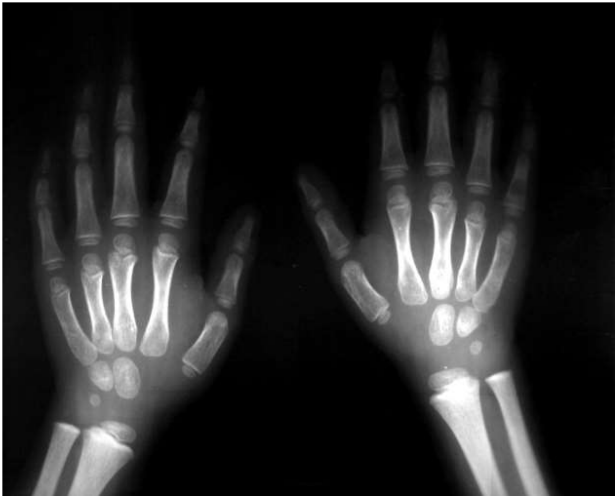
Figure 2. Longbone radiographs of hands

"Lead lines" in five year old male with radiological growth retardation and blood lead level of 37.7\mu\text{g}/\text{dL} .