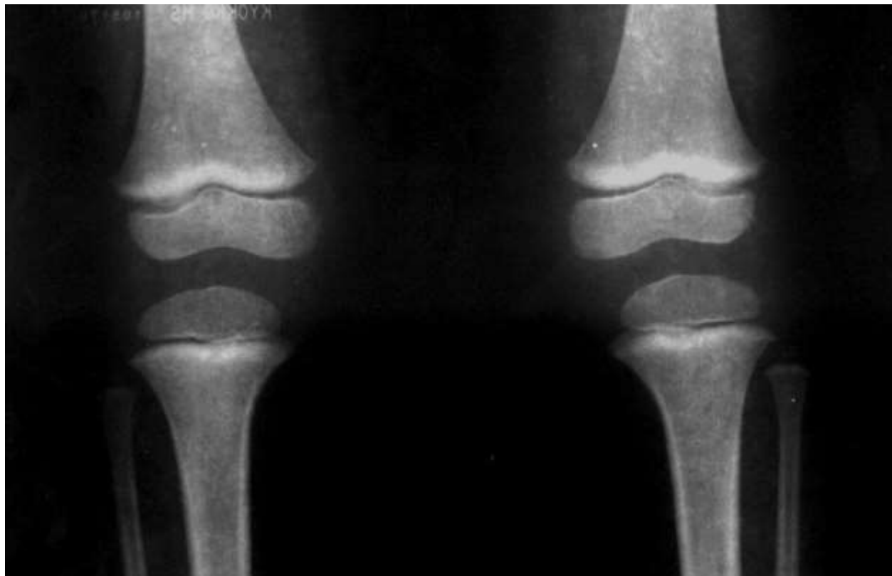
Figure 3. Longbone radiographs of knees. “Lead lines” in three-year-two-month-old girl with Blood lead level of 10.6 \mu\text{g}/\text{dL} . Notice the increased density on the metaphysis growth plate of the knee.