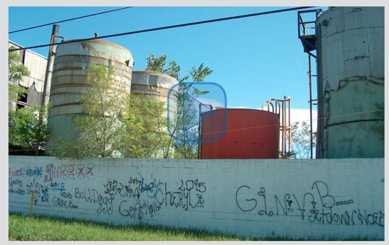
Deteriorated former chemical storage tanks (ATSDR, 2010)

The video entitled Environmental Justice in Dal