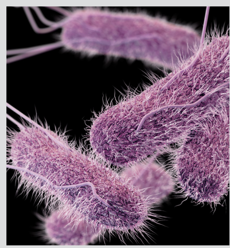
Artist's 3-D rendering of Salmonella bacteria

For further information and practice with real-life outbreaks visit the CDC's Epidemiologic Case Studies website. Here you will be able to interact with computer-based case studies, classroom case studies, and an outbreak simulation. These simulations require download and may be used offline.