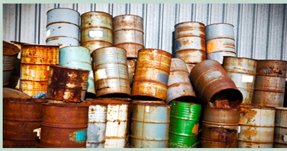
Drums containing potentially hazardous waste.

Environmental epidemiology is concerned with environmental conditions or hazards that may pose a health risk to populations.<sup>1</sup> For example, epidemiologists may investigate a cancer cluster in a particular community, or question whether people with a particular disease have higher levels of exposure than people without the disease.