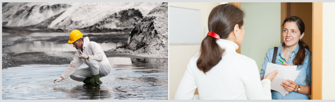
Left to right: Water sampling, surveillance

To learn more about the role the environment plays on public health go to the lesson funded by NIEHS <u>Teaching Environmental Public Health: The</u> <u>Role of Epidemi</u> gov . In this lesson you will be able to explore a few short videos on the history of epidemiology and about potential disease clusters due to environmental exposures.