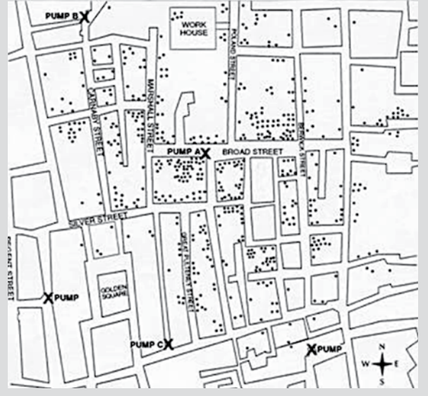
Map of Cholera outbreak used by John Snow

To learn more about the basics of epidemiology and biostatistics check out the "self-study course" designed by Centers for Disease Control and Prevention (CDC) on <u>Applied Epidemiology and Biostatistics</u>. This course is designed to describe key features of epidemiology, and provide explanations for calculating and interpreting several key epidemiological elements. This course also describes the steps to successfully conducting an outbreak investigation.