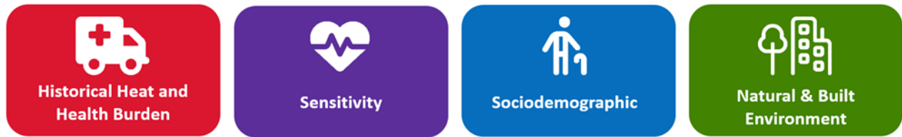
Figure 1. The four modules included in the HHI.

Each indicator used within the HHI was organized into the modules described above. All indicators were selected based on review of the literature, existing indices and databases, subject matter expert guidance, data availability nationwide at the ZIP code level, satisfying inclusion criteria, and statistical analysis, including correlation analysis. Additional details on the inclusion criteria for indicators are provided in the methods section below.