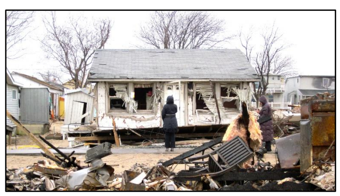
Hurricane Sandy -Breezy Point, NY

These factors are known as social vulnerability .