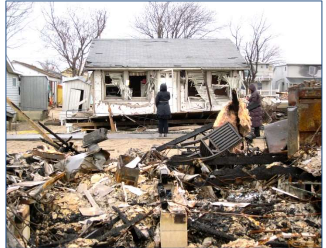
Hurricane Sandy - Breezy Point, NY

ATSDR's Geospatial Research, Analysis & Services Program (GRASP) created databases to help emergency response planners and public health officials identify and map communities that will most likely need support before, during, and after a hazardous event.