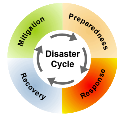
Figure 1. The disaster cycle.

This paper, therefore, addresses an important subcomponent of the disaster management risk equation—social vulnerability—with the goal of improving all phases of the disaster cycle.