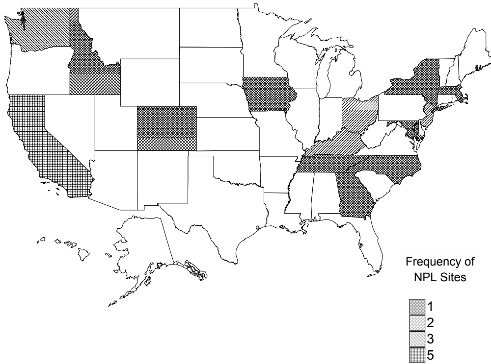
Figure 6-3. Frequency of NPL Sites with 137 Cs Contamination