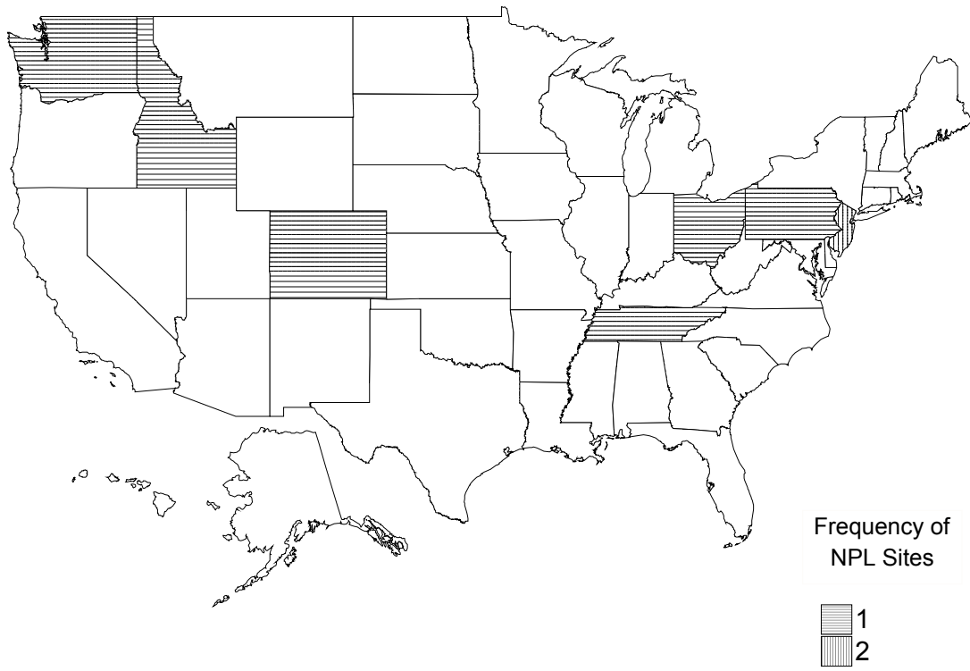
Figure 6-1. Frequency of NPL Sites with Cesium Contamination